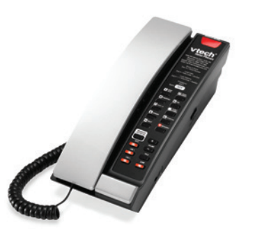
Corded Non-Speakerphone -Petite Phone® S2211-L | S2221-L