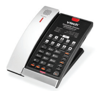
Cordless Speakerphone CTM-S2411 | CTM-S2421