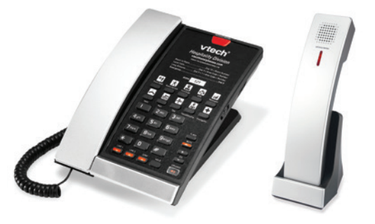
Corded-Cordless Speakerphone Bundle CTM-A2510-USB