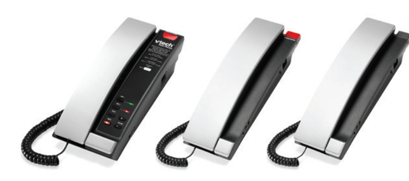
TrimStyle A2310 | A2310-NM A2321