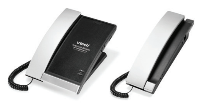
Lobby-Public Areas A2100 | A2310-NM