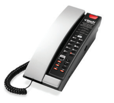
Corded Non-Speakerphone – Petite Phone® A2211 | A2221-L2