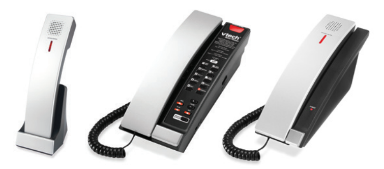
Cordless Accessories CTM-S241SDU | CTM-S242SDU CTM-S241P | CTM-S242P S2310 | S2320