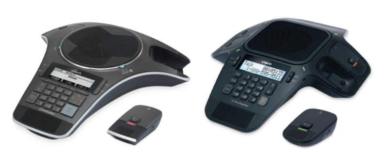
Conference phones for your hotel meeting spaces