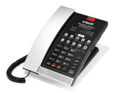
Corded Speakerphone S2210-L | S2220-L