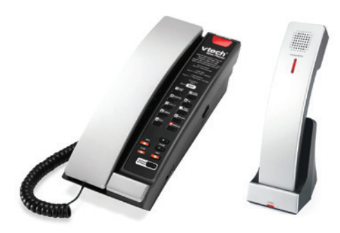
Cordless Accessories CTM-A241SDU | CTM-A242SDU CTM-A241P | CTM-A242P