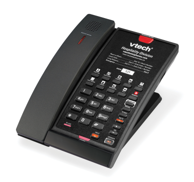
CTM-A2411/CTM-A2411-BATT (Matte Black)